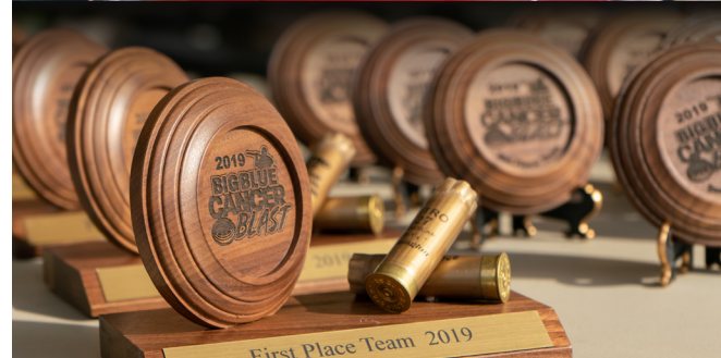
See more at www.bigbluecancerblast.com